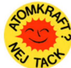
FMKK, Folkkampanjen mot Kärnkraft-Kärnvapen, Sweden

Published by Ceedata, Chaam, The Netherlands, on behalf of WISE, November 2015