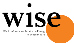
WISE International World Information Service on Energy